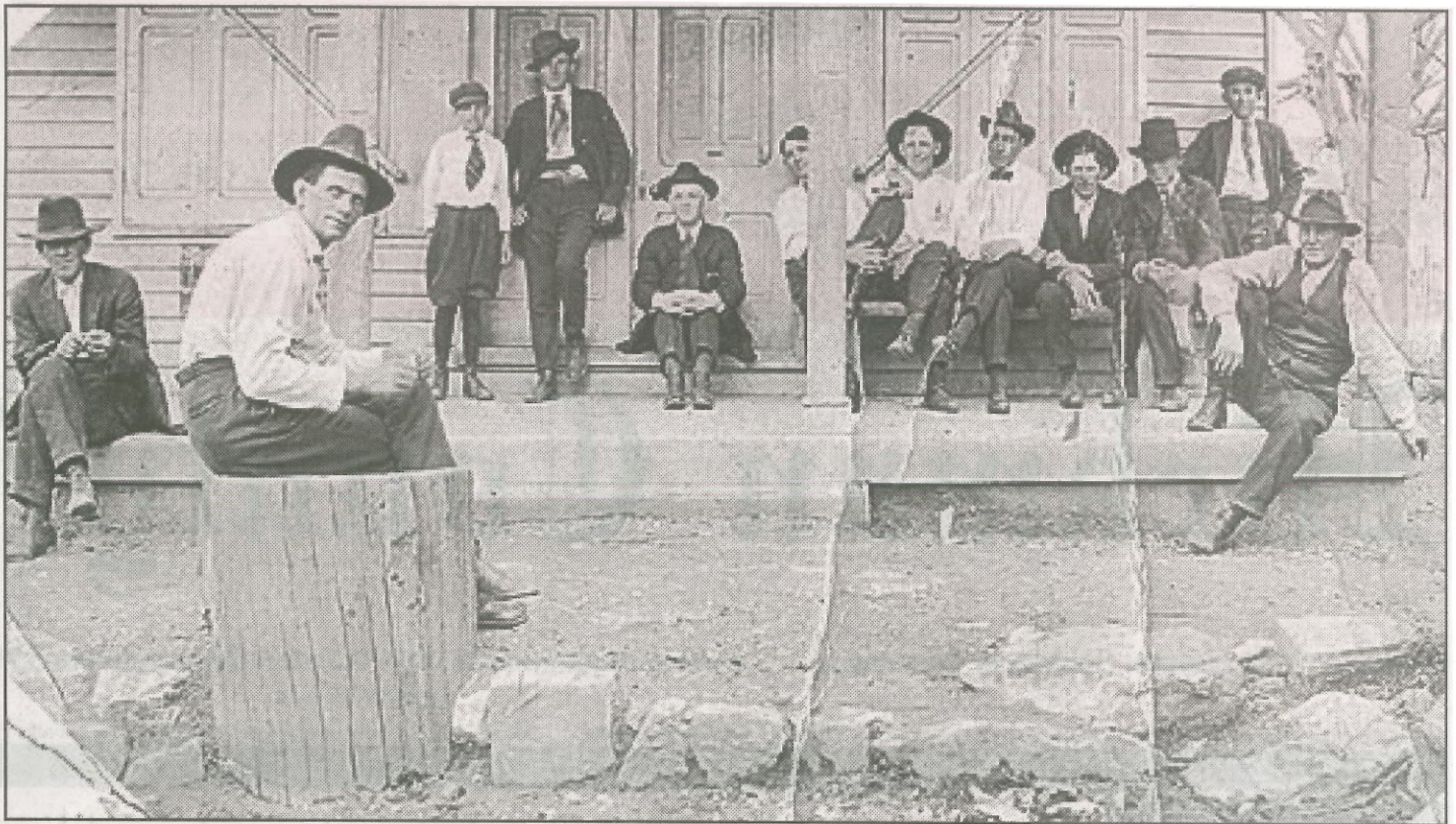
Outside the old Shady Grove store.